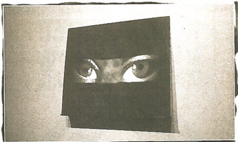
Eyes on you